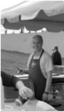
MP Kelly McCauley